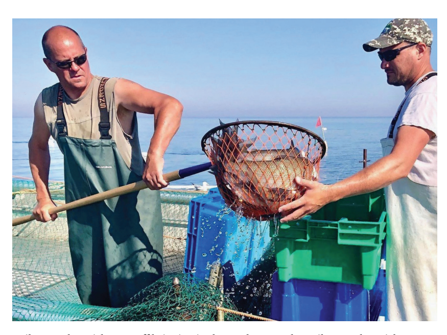
Baileys Harbor Fish Co. staff bringing in the catch.

Wisconsin's commercial and tribal fishermen rely on sales to Europe to augment their income. Because of negative sustainability ratings developed by the World Wildlife Fund-European Union about Great Lakes fish, importers were not buying product from Wisconsin. Sea Grant intervened with educational materials and facilitated dialogue. In 2023 the ratings were revised, opening the door to $15 million in annual sales.